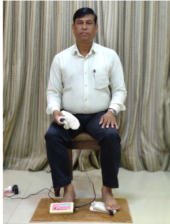
One Rod on Right hand another on Left Sole