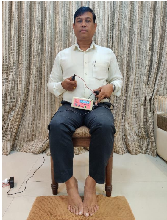
Copper Rods are in Hands