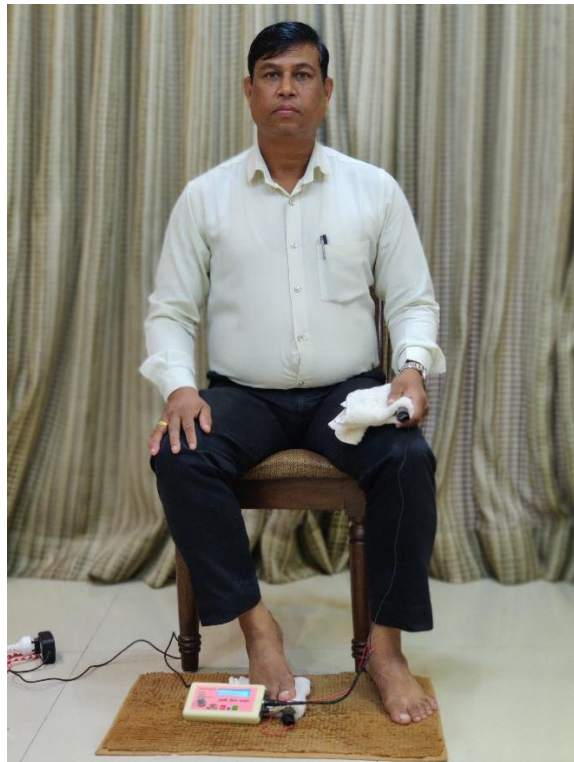
One Rod on Left hand another on Right Sole