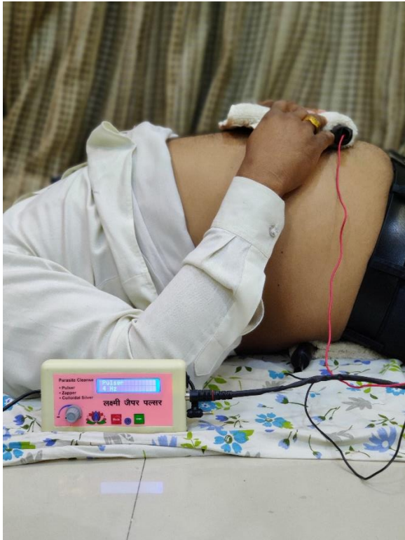
One Rod is below the back and another is on stomach (Keep changing the position on stomach)