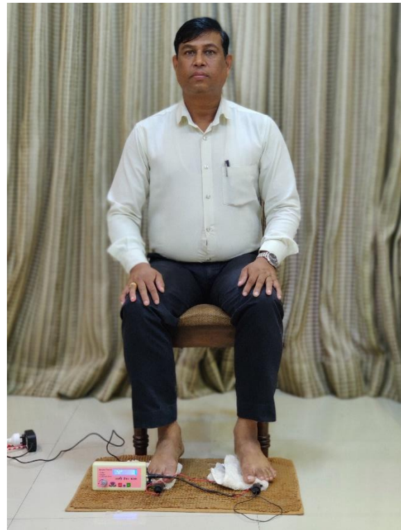
Both Rods are under the Soles