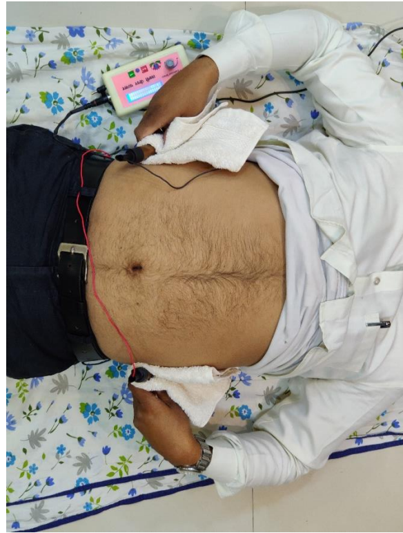
One Rod is on left side of stomach another is on right side of stomach